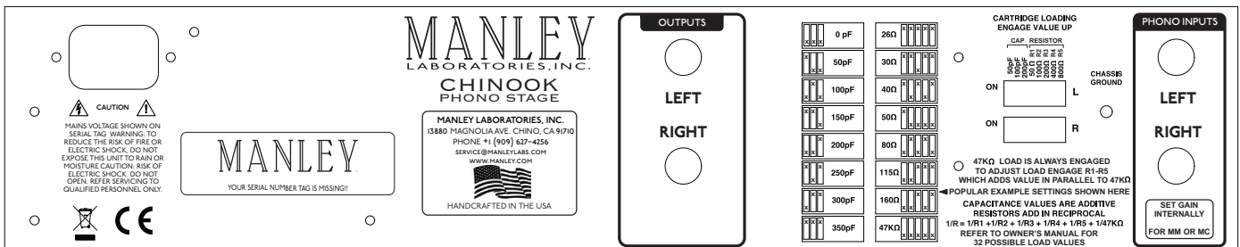
Fig.1 - Rear Panel Layout

See Below Fig.1; An example of the rear panel showing the location of the loading dip switches.